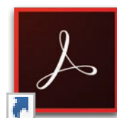
Acrobat Reader DC

The Acrobat Reader DC shortcut icon will now be on your desktop.