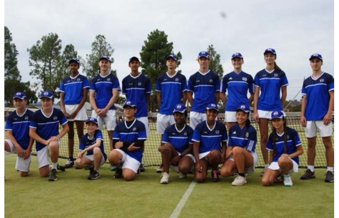
▲ What a feat getting the entire team into one photo!

The annual Pat Cash Cup was held in Wodonga on 27 and 28 February 2021. Our Waverley Tennis team made it to the semi-finals which were played on the Sunday, battling it to place 4th overall – well done to all the players (and thanks to the parents for driving all the way up to the border)!